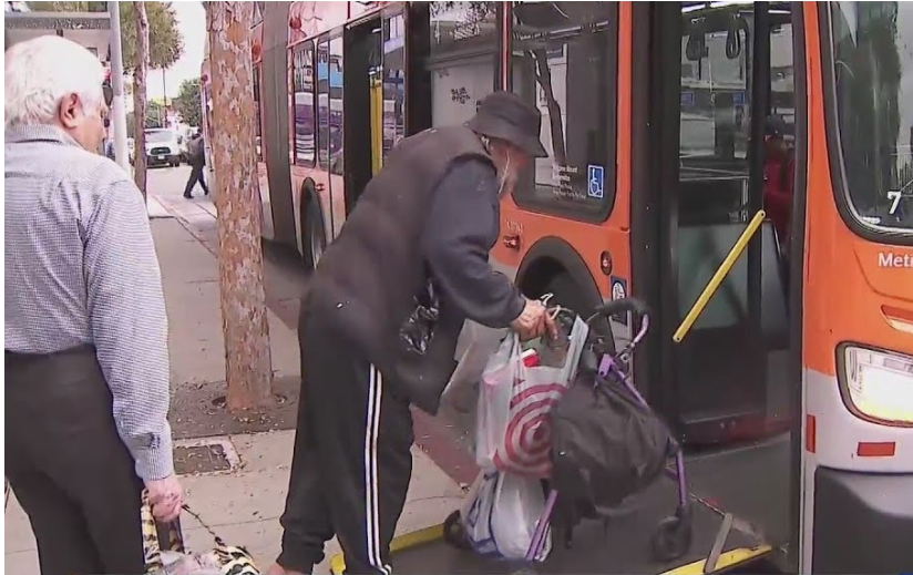
ASSAULTS ON TRANSIT WORKERS RISING