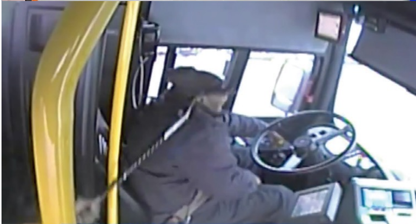
NOW @ 5:00